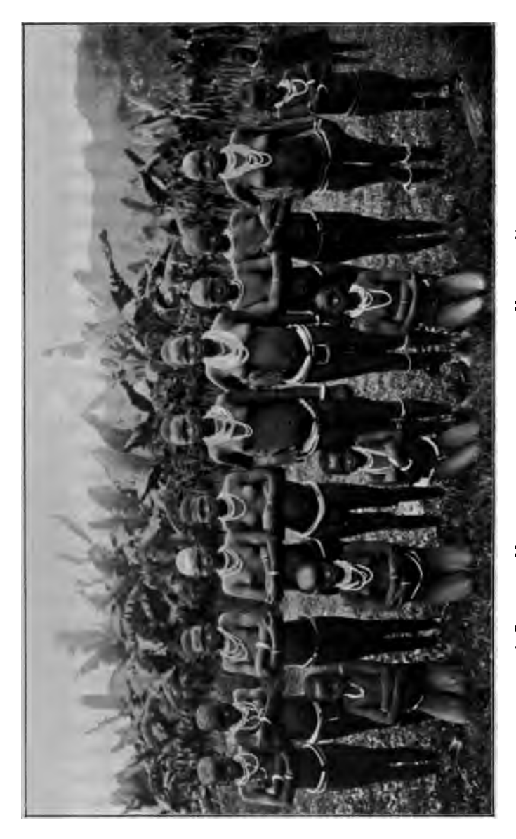
A GROUP OF MAIDENS-ON THE SHORES OF THE VICTORIA NYANZA.