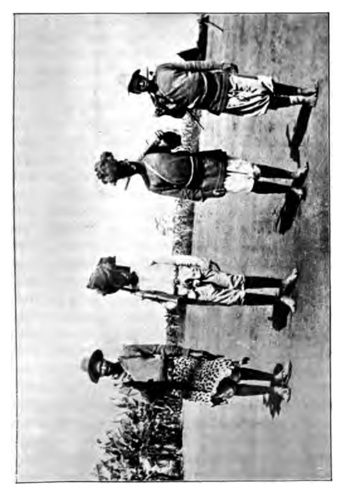
SUDANESE OF THE UGANDA RIFLES ON THE MARCH, 1897.