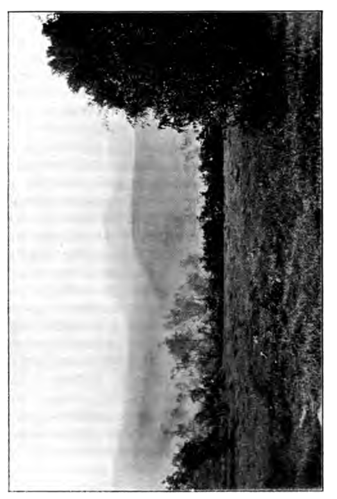
IN THE GREAT MERIDIONAL RIFT-THE REDONG VALLEY.