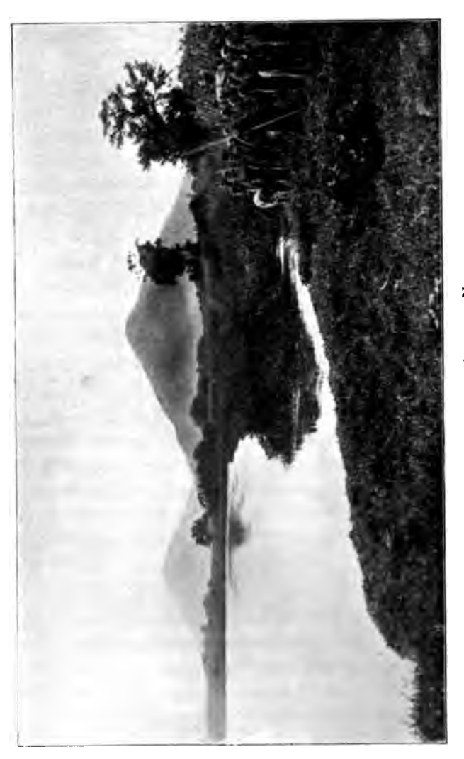
A VIEW ON THE VICTORIA NYANZA.