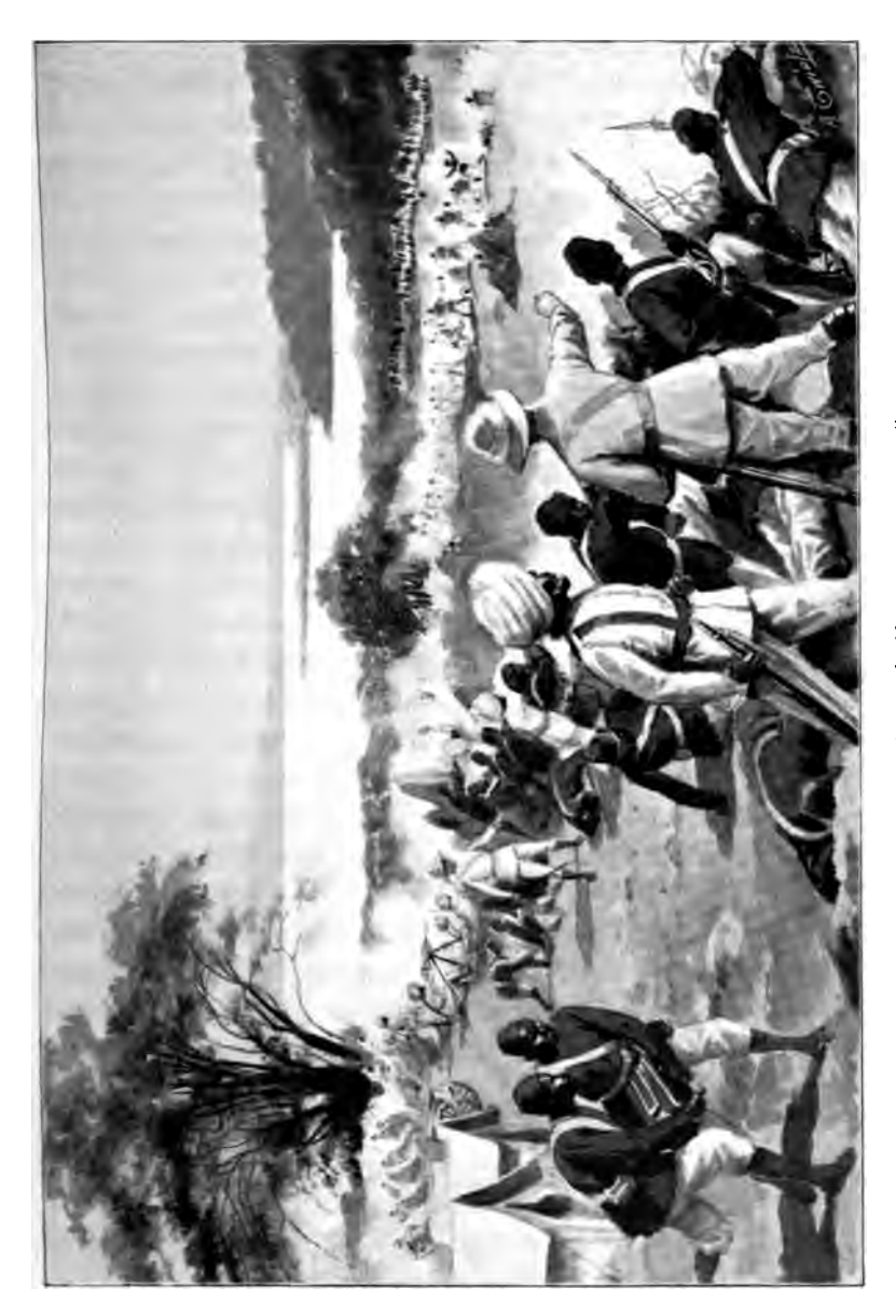
THE ENGAGEMENT ON LUBWA'S HILL, OCT. 1011, 1897.